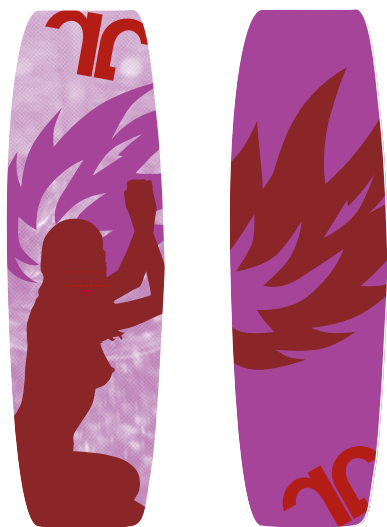
Honey 125 Length 125 cm Width 39 cm