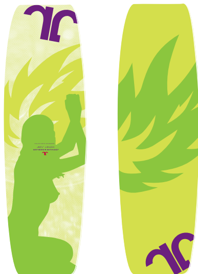
Honey 128 Length 128 cm Width 40 cm