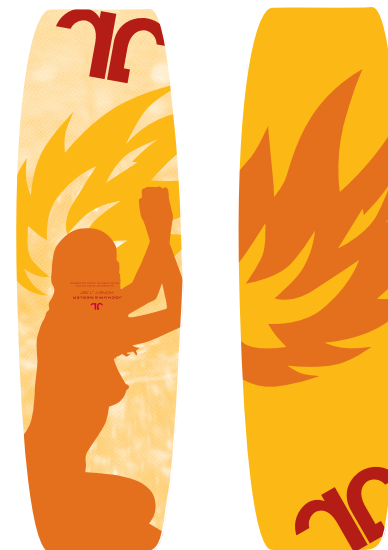
Honey 132 Length 132 cm Width 41 cm

The Honey is a from pro-riders developed wakestyle board, which is suited especially for all new school manoeuvres. Because of the wide cut, it starts planing very fast even with a smaller kite. Smooth and loose the board glides over the water. Powerful landings and tricks to blind will be easy to fulfil. But not only landing is important for wakestyling, the Honey comes with a good pop up when jumping off and allows the kiter even in unhooked position to slide through the wind gaps. Also high jumps are amazing with this board. We recommend this board for all ambitious riders, who like to ride a "loose" board. Developed by: Kristin Boese, Marc Ramseier, Mikael Blomwall, André Natland